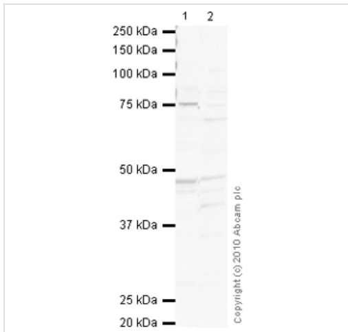
Western blot - Anti-Dopamine Receptor D1 antibody (ab40653)

All lanes : Anti-Dopamine Receptor D1 antibody (ab40653) at 1/1000 dilution