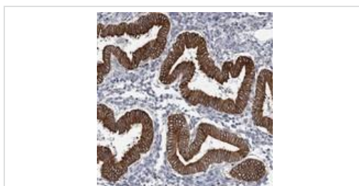
Immunocytochemistry/ Immunofluorescence - Anti- PLEKHG4B antibody (ab122325)

Immunohistochemical staining(Formalin/PFA-fixed paraffin-embedded sections) of human corpus, uterine with ab122325 at 1/1000 dilution showing strong cytoplasmic positivity in glandular cells.