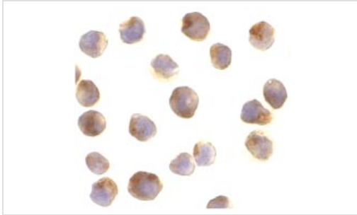
ab26264 at 10µg/ml staining Raptor in L1210 cells by ICC/IF

Immunocytochemistry/ Immunofluorescence - Anti-Raptor antibody (ab26264)