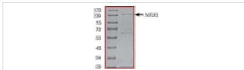
SDS Page analysis of ab84799

Functional Studies - MYLK3 protein (Active) (ab84799)