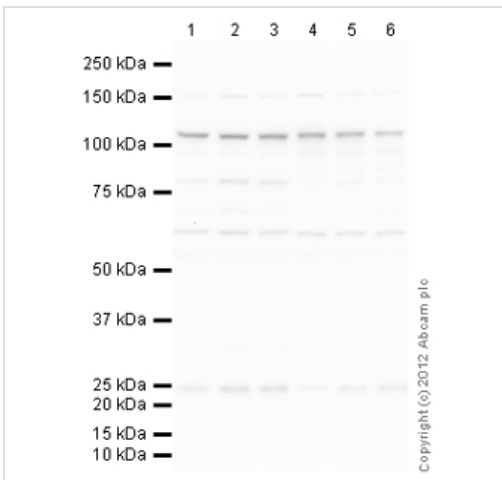
Western blot - Anti-SUN1 antibody (ab103021)

ICC/IF image of ab103021 stained HepG2 cells. The cells were 4% formaldehyde fixed (10 min) and then incubated in 1%BSA / 10% normal goat serum / 0.3M glycine in 0.1% PBS-Tween for 1h to permeabilise the cells and block non-specific protein-protein interactions. The cells were then incubated with the antibody (ab103021, 5µg/ml) overnight at +4°C. The secondary antibody (green) was ab96899 , DyLight® 488 goat anti-rabbit IgG (H+L) used at a 1/250 dilution for 1h. Alexa Fluor® 594 WGA was used to label plasma membranes (red) at a 1/200 dilution for 1h. DAPI was used to stain the cell nuclei (blue) at a concentration of 1.43µM. This antibody also gave a positive result in 4% formaldehyde fixed (10 min) HeLa, Hek293 and MCF7 cells at 5µg/ml, and in 100% methanol fixed (5 min) HeLa and MCF7 cells at 5µg/ml.