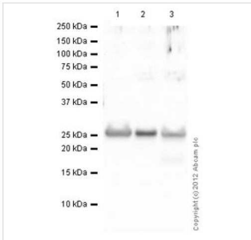
Western blot - Anti-Serum Amyloid P antibody [342CT9.4.7] (ab87914)

All lanes : Anti-Serum Amyloid P antibody [342CT9.4.7] (ab87914) at 5 µg/ml