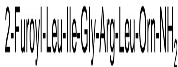
2D chemical structure image of ab120800, 2-Furoyl-LIGRLO-amide (2Fly), PAR2agonist