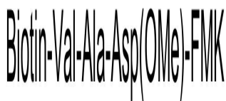
Chemical Structure - Biotin-VAD-FMK, pan-caspase inhibitor (ab142032)

2D chemical structure image of ab142032, Biotin-VAD-FMK, pan-caspase inhibitor