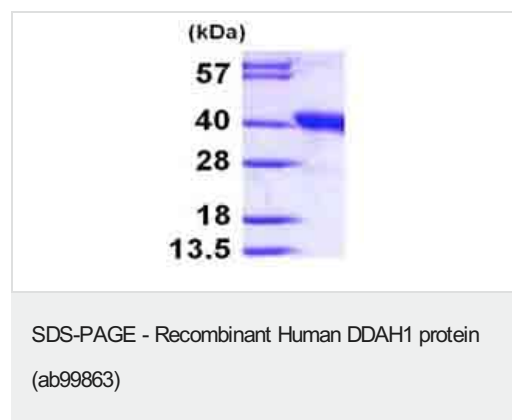
15% SDS-PAGE showing ab99863 (3µg).