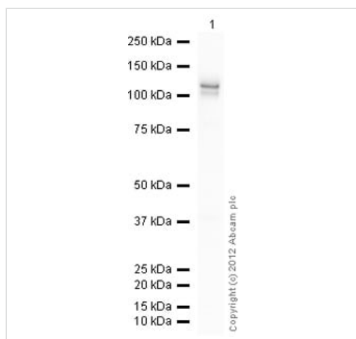
Western blot - Recombinant Human Rb protein (ab83205)

Please note: All products are "FOR RESEARCH USE ONLY. NOT FOR USE IN DIAGNOSTIC PROCEDURES"