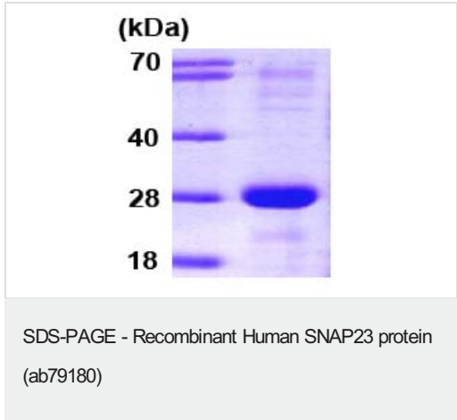
15% SDS-PAGE showing ab79180 (3µg).