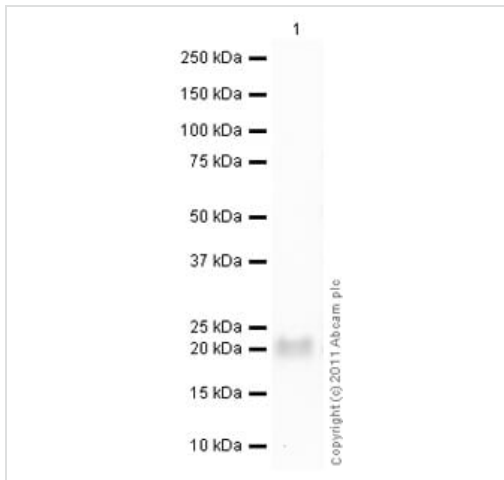
Western blot - Recombinant human TIMP1 protein (ab82104)

Please note: All products are "FOR RESEARCH USE ONLY. NOT FOR USE IN DIAGNOSTIC PROCEDURES"