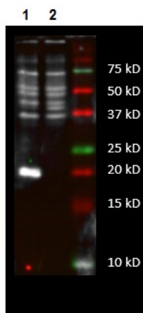
Western blot - Anti-MT-ATP6 antibody [1G7-1G2] - N-terminal (ab219825)

All lanes : Anti-MT-ATP6 antibody [1G7-1G2]