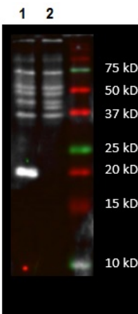
Western blot - Anti-MT-ATP6 antibody [1G7-1G2] - N-terminal (ab219825)

Mitochondrial proteins solubilized in 2% SDS were separated by SDS-PAGE and then transferred to PVDF membranes in CAPS buffer.