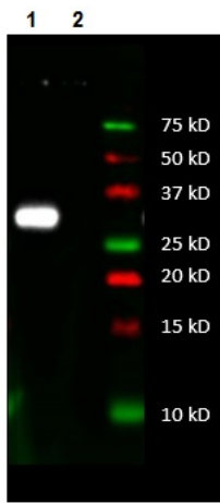
Western blot - Anti-MT-CYB antibody [5B3-6E3] - N-terminal (ab219823)

All lanes : Anti-MT-CYB antibody [5B3-6E3] - N-terminal (ab219823) at 0.1 µg/ml