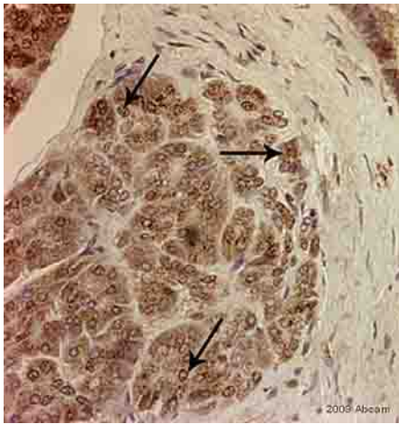
Immunohistochemistry (Formalin/PFA-fixed paraffin-embedded sections) - Anti-RBPJK antibody (ab33065)