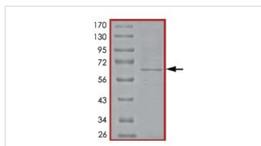
SDS-PAGE analysis of ab125661.