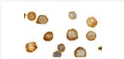
ab37071 at 10µg/ml staining TLR5 in THP-1 cells by ICC/IF

Immunocytochemistry/ Immunofluorescence - Anti-TLR5 antibody (ab37071)