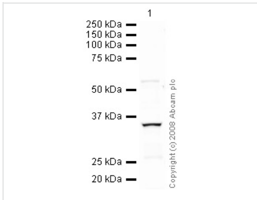
Western blot - Anti-TRAIL antibody (ab42243)

Anti-TRAIL antibody (ab42243) at 1 µg/ml + A549 whole cell lysate (ab7910) at 10 µg