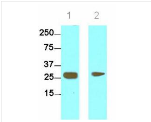
Western blot - Anti-HMGB1 antibody [J2E1] (ab80246)

All lanes : Anti-HMGB1 antibody [J2E1] (ab80246) at 1/500 dilution