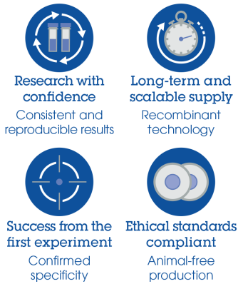
Anti-ACOT7 antibody [EPR11317(B)] - BSA and Azide free (ab249270)

Please note: All products are "FOR RESEARCH USE ONLY. NOT FOR USE IN DIAGNOSTIC PROCEDURES"