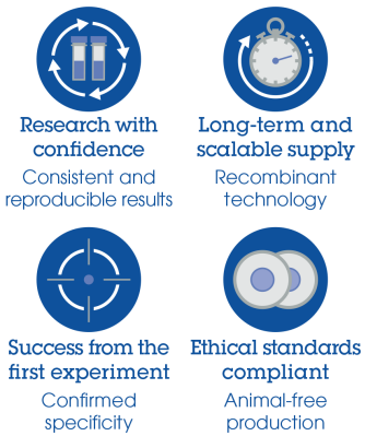
Anti-CD11a antibody [hu1124 (Efalizumab)] - Chimeric (ab275978)

Please note: All products are "FOR RESEARCH USE ONLY. NOT FOR USE IN DIAGNOSTIC PROCEDURES"