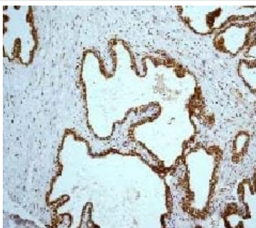
Immunohistochemistry (Formalin/PFA-fixed paraffin-embedded sections) - Anti-CREB antibody [E306] - BSA and Azide free (ab221216)

Ab32515, at a 1/500 dilution, staining CREB in paraffin embedded human prostatic carcinoma tissue sections by Immunohistochemistry.