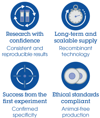
Anti-GRIK3/GluK3 antibody [EPR13726] (ab183035)