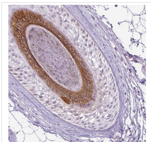
Immunohistochemical analysis of formalin fixed, paraffin embedded Human hair tissue labeling K27 with ab220725 at 1/2500 dilution.

Immunohistochemistry (Formalin/PFA-fixed paraffin-embedded sections) - Anti-K27 antibody (ab220725)