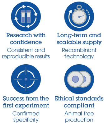
Anti-MYBBP1A antibody [EPR7204] (ab125026)

Please note: All products are "FOR RESEARCH USE ONLY. NOT FOR USE IN DIAGNOSTIC PROCEDURES"