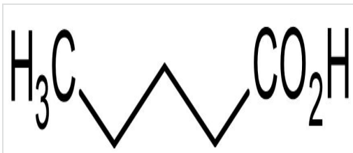
Chemical Structure - n-Valeric acid (n-Pentanoic acid), short chain fatty acid (ab145166)

2D chemical structure image of ab145166, n-Valeric acid (n-Pentanoic acid), short chain fatty acid