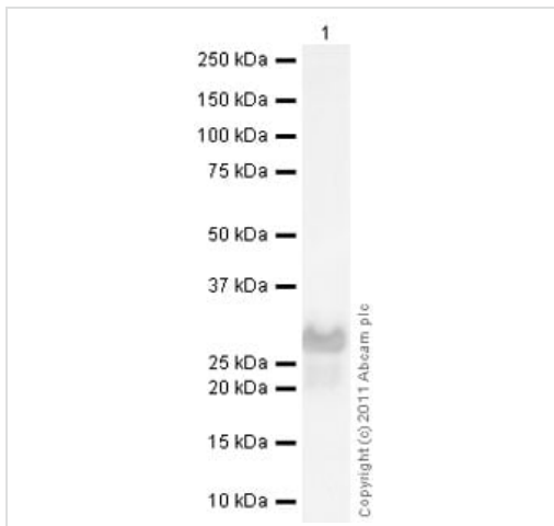
Western blot - Anti-NGF antibody - BSA and Azide free (ab6199)

Anti-NGF antibody - BSA and Azide free (ab6199) at 1 µg/ml + Active human NGF full length protein (ab69759) at 0.1 µg