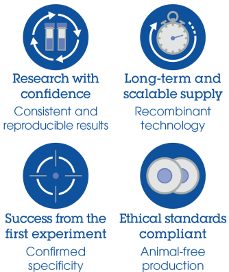
Anti-PDCD2 antibody [EPR7159] (ab126614)

Please note: All products are "FOR RESEARCH USE ONLY. NOT FOR USE IN DIAGNOSTIC PROCEDURES"