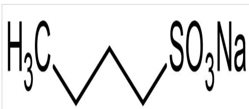
Chemical Structure - 1-Butanesulfonic acid sodium salt, Anionic surfactant (ab146210)

2D chemical structure image of ab146210, 1-Butanesulfonic acid sodium salt, Anionic surfactant