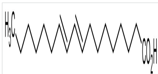
Chemical Structure - 9(E),11(E)-Octadecadienoic acid, Conjugated linoleic acid (ab143895)

2D chemical structure image of ab143895, 9(E),11(E)-Octadecadienoic acid, Conjugated linoleic acid