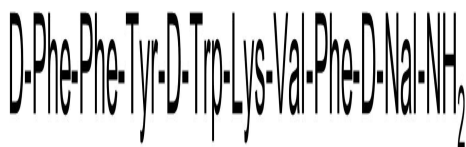
Chemical Structure - BIM 23056, Somatostatin receptor 5 (sst 5 ) antagonist (ab141212)

2D chemical structure image of ab141212, BIM 23056, Somatostatin receptor 5 (sst 5 ) antagonist