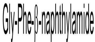
Chemical Structure - Gly-Phe beta-naphthylamide, Cathepsin C substrate (ab145914)

2D chemical structure image of ab145914, Gly-Phe beta-naphthylamide, Cathepsin C substrate