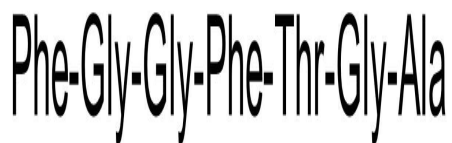
Chemical Structure - Nociceptin (1-7) (Orphanin FQ (1-7)), Endogenous ligand for ORL1 (ab120741)

2D chemical structure image of ab120741, Nociceptin (1-7) (Orphanin FQ (1-7)), Endogenous ligand for ORL1