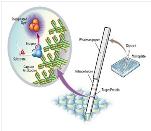
Functional Studies - Complex IV Rodent Enzyme Activity Dipstick Assay Kit - 90 tests (ab109878)

Abcam's enzyme activity assays apply a novel approach, whereby target enzymes are first immunocaptured from tissue or cell samples before subsequent functional analysis. Dipstick ELISA Kits extend this concept by utilizing the well-established lateral flow concept, wherein capture antibodies are striped onto nitrocellulose membrane and a wicking pad draws the sample through the antibody bands. All of our ELISA kits utilize highly validated monoclonal antibodies and proprietary buffers, which are able to capture even very large enzyme complexes in their fully-intact, functionally-active states.