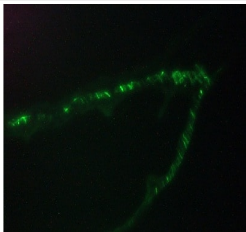
Immunohistochemistry (Frozen sections) - Anti-Desmin antibody [RD301] (ab8976)

Please note: All products are "FOR RESEARCH USE ONLY. NOT FOR USE IN DIAGNOSTIC PROCEDURES"