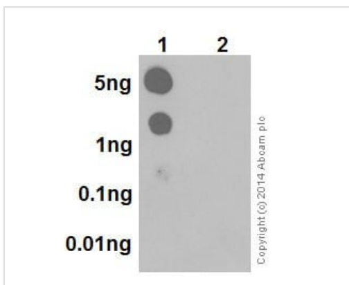
Dot Blot - Anti-p53 (phospho T55) antibody [EPR17729] - BSA and Azide free (ab250672)

This data was developed using ab183546 , the same antibody clone in a different buffer formulation. Dot blot analysis of p53 (phospho T55) using ab183546 at 1/1000 dilution, followed by Goat Anti-Rabbit IgG, (H+L), Peroxidase conjugated secondary antibody at 1/1000 dilution. Lane 1: Phospho peptide Lane 2: Non-phospho peptide Blocking/Dilution buffer: 5% NFDM/TBST. Exposure time of 3 minutes.