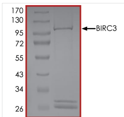
SDS-PAGE analysis of ab268366.