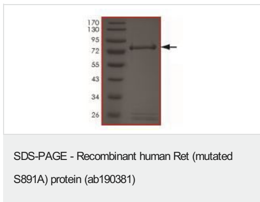
SDS-PAGE analysis of ab190381.

Please note: All products are "FOR RESEARCH USE ONLY. NOT FOR USE IN DIAGNOSTIC PROCEDURES"