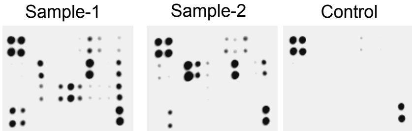
Figure 1: Representative image obtained with Abcam's Human Cytokine Antibody Array.

These membranes were probed with conditioned media from two different cell lines. Membranes were exposed to film at room temperature for 1 minute.