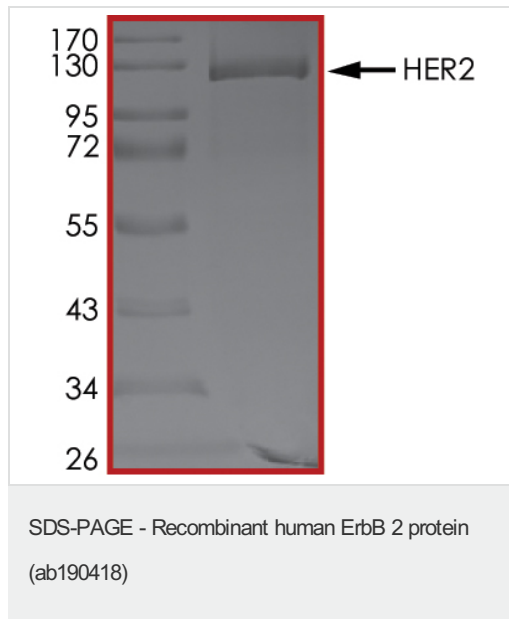
SDS PAGE analysis of ab190418