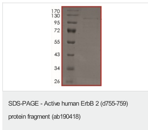
SDS PAGE analysis of ab190418.