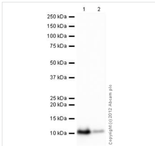
Western blot - Recombinant Human Glutaredoxin 1 protein (ab86987)