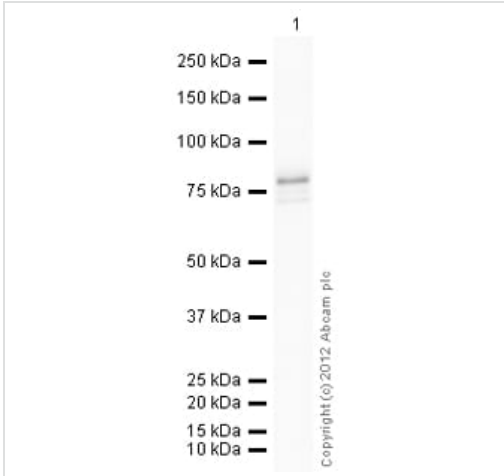
Western blot - Recombinant Human MNK1 protein (ab62572)

Please note: All products are "FOR RESEARCH USE ONLY. NOT FOR USE IN DIAGNOSTIC PROCEDURES"