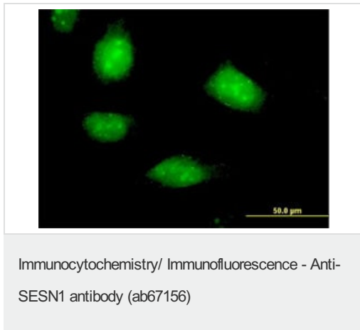
Immunofluorescence of ab67156 at 10 µg/ml on HeLa cells

Please note: All products are "FOR RESEARCH USE ONLY. NOT FOR USE IN DIAGNOSTIC PROCEDURES"