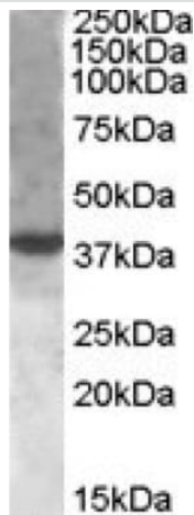
Western blot - Anti-XBP1 antibody (ab85546)

Immunohistochemical analysis of formalin-fixed paraffin-embedded human breast tissue using ab85546 at a dilution of 5 \mu g/ml.